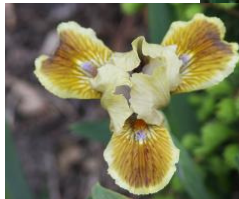
Senorita Frogg (D. Spoon, 2002)