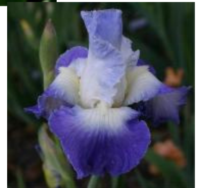
Hot Glow (Tasco, 2006)