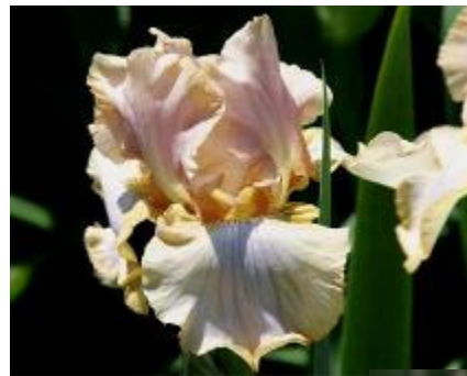
Liquid Amber (G. Spoon, 2003)

of Maymont Park, your Region 4 Reblooming Chairman spent 100 plus hours caring for these plantings. Growing conditions varied at each location. There were however some interesting common denominators. TBs Lunar Whitewash and Northward Ho were consistent performers at all three sites. Likewise, only four varieties out of 52 failed to rebloom at JSRCC. Since the horticulture department faculty there is headed by landscape industry professionals, rebloom's outstanding performance did not go unnoticed.