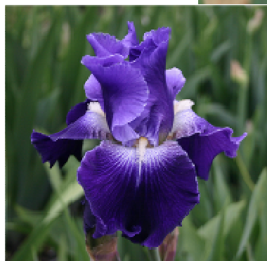
Daughter of Stars (D. Spoon, 2001),