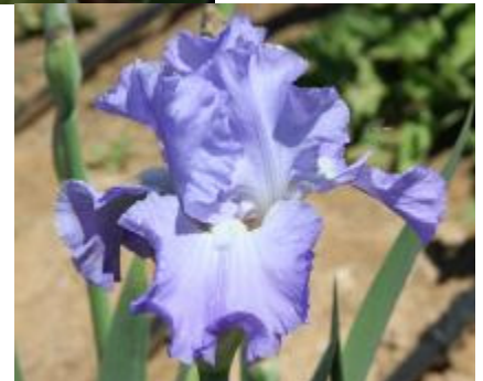
Gate of Heaven (Zurbrigg, 2004)