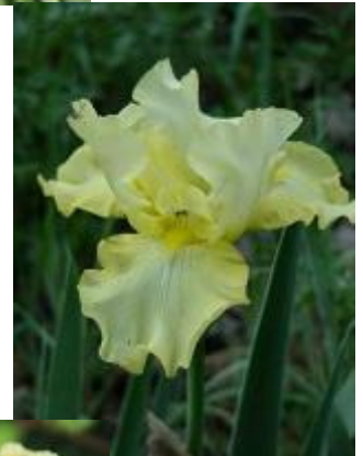
Sunny Disposition (Zurbrigg, 1991).