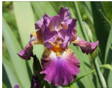
Starring Encore (D. Spoon, 2008)

Again, Pink Attraction and Over & Over plus medians Lady Emma and SDB Senorita Frogg (D. Spoon, 2002). As in May, the night temperature trigger remained in place during June in Goochland. Distinct periods of 60°F or less appeared throughout the month in the Richmond metro area. Adequate moisture was another important ingredient driving performance. Twenty-six varieties out of 52 planted at JSRCC were in bloom heading into the July 4 th weekend.